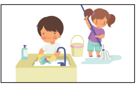
With the things you do